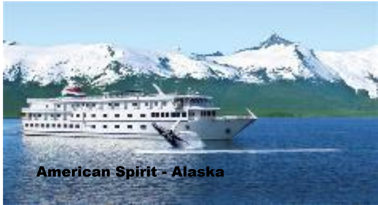
American Spirit - Alaska