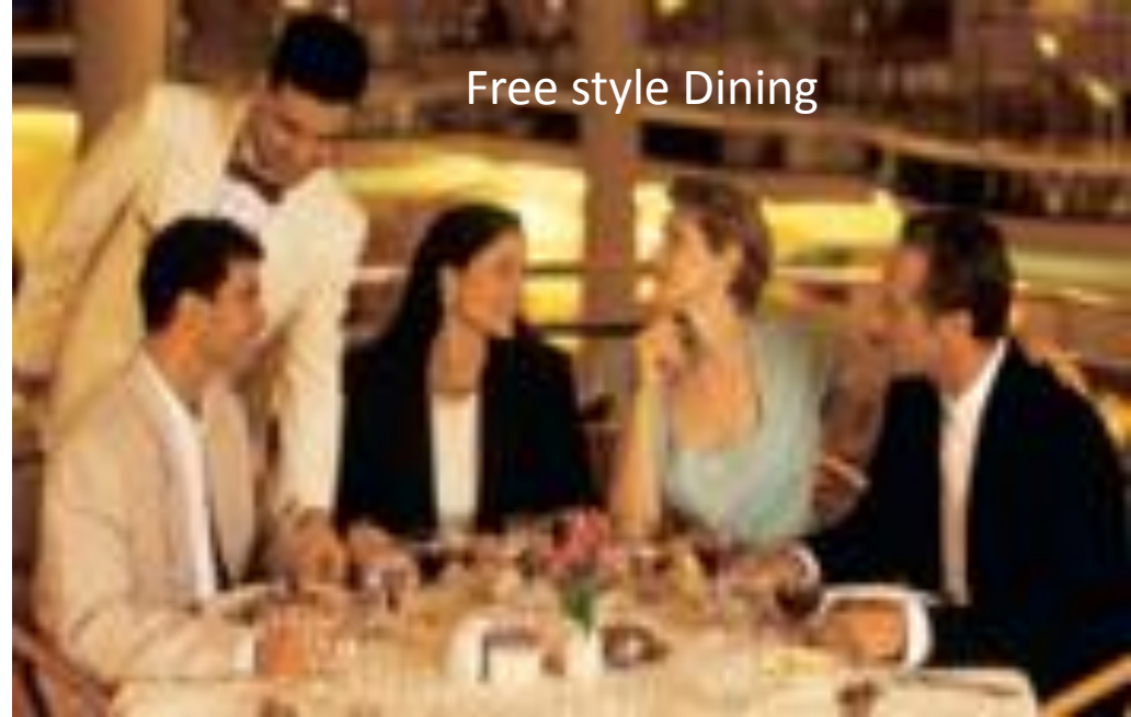
Free style Dining